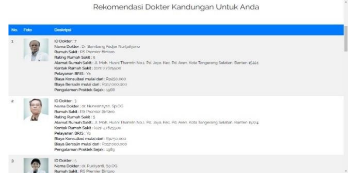
Fig 5. Results of Obstetrician Recommendations

Figure 4 shows the main page of the obstetrician recommendation system using the VIKOR method. Website users will receive information about the recommendation system website and the form that must be filled in to get the obstetrician's recommendation results. No recommendation results will appear if the user does not fill out the form completely.