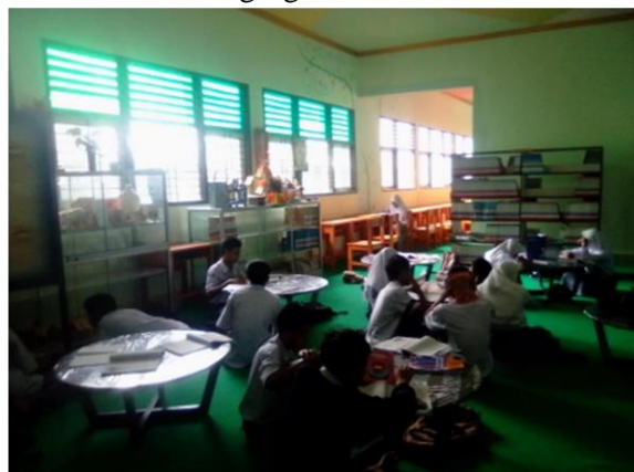
Fig 4. Students visiting the Library

Based on the results of the researcher's interviews with students, student visits to the library were stated to be busy, according to student answers which stated that they went to the library usually 3 to 4 times a week, for various purposes, such as borrowing books, reading subject matter, and returning books that were has been borrowed, as illustrated in the following figure.