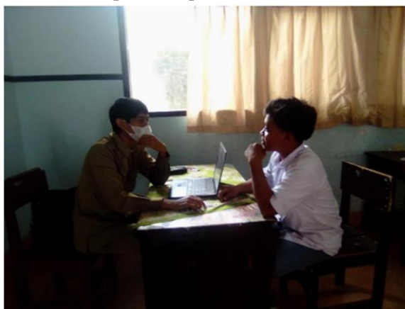
Fig 2. Researchers conducted interviews with students

From the first grid, namely how often students visit the library, the researcher makes questions, which are number one on student questions and also teachers, vice principals and librarians. From the questions, the researcher can see how often students visit the library. Furthermore, for the grid whenever students visit the library, the researcher makes question number two. For questions number three and four, the researcher used a grid of types of books borrowed by students. Next, the student's knowledge grid about the system used by the researcher's library made questions number five, six, seven, and eight. As for the last grid, namely looking at the advantages and disadvantages of the Inlislite information system and suggestions for the Inlislite information system, the researcher put it in questions 9 and 10.