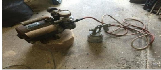
Figure 3: old work tool