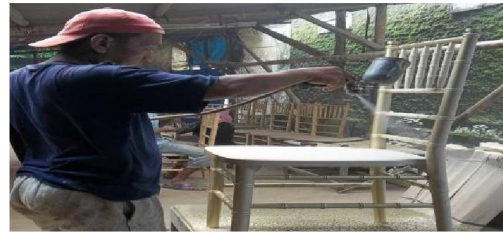
Figure 2: work position 2