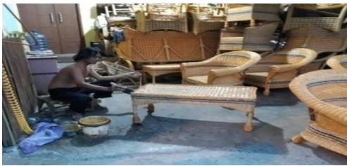
Figure 1: work position 1