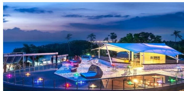
Fig 4. Sky Bar