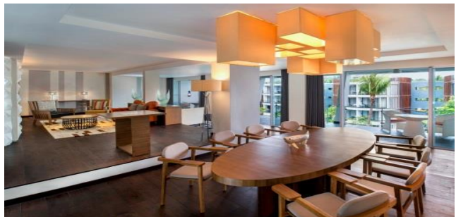
Fig 2. Grande Avant Garde Suites

Meanwhile, the supporting facilities complement the luxury of Le Meridien Bali Jimbaran, also only 2 facilities are displayed from the onesthere are those depicted as in the picture below.