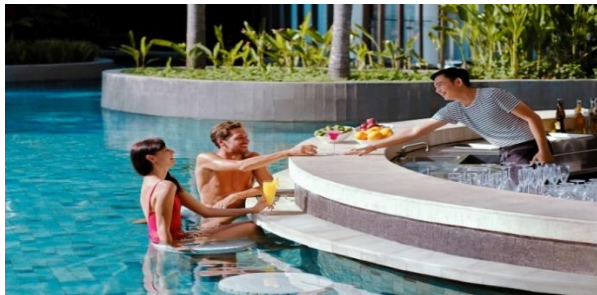
Fig 3. Pool Bar

Meanwhile, the supporting facilities complement the luxury of Le Meridien Bali Jimbaran, also only 2 facilities are displayed from the onesthere are those depicted as in the picture below.